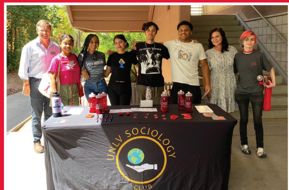
Sociology Club Welcome Day 2022